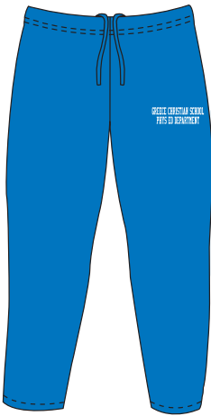
3. Sweat Pants