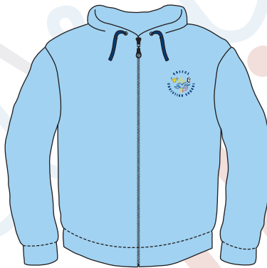
6. Full Zip Hoodie

Order deadline is the 10th of each month