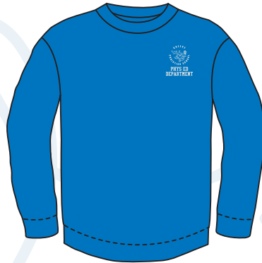
4. Sweat Shirt (gym class only)